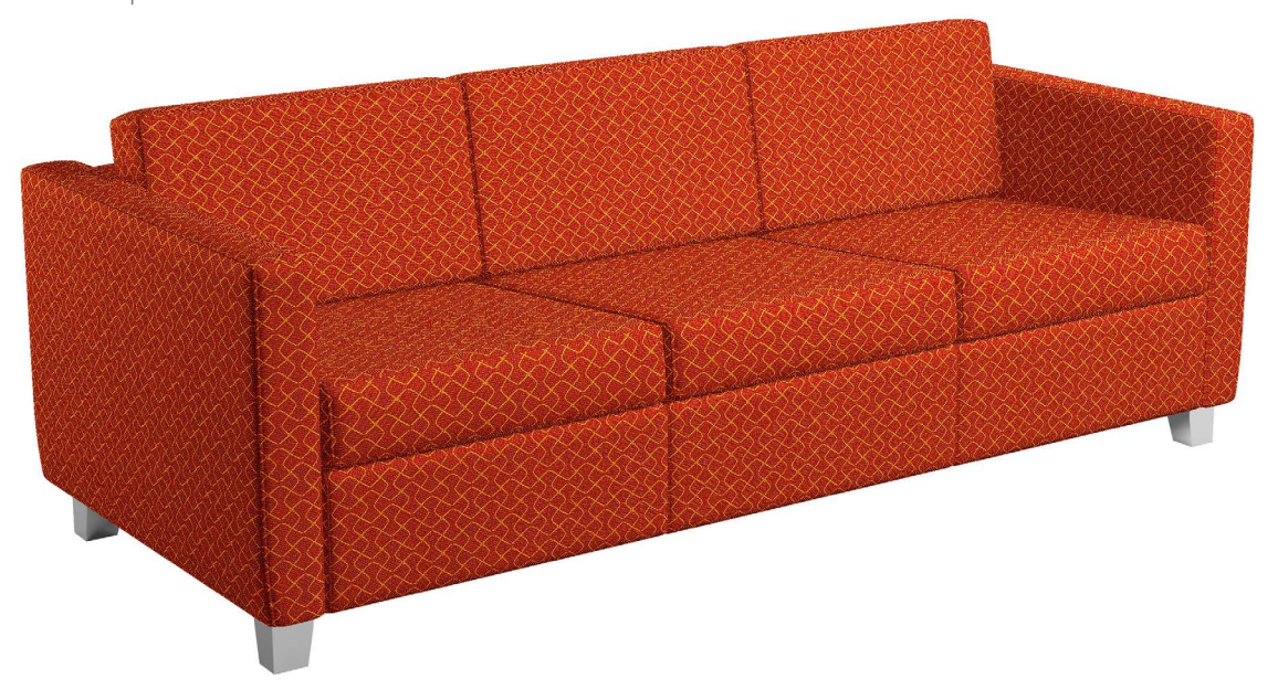
1223-CH AXIS | PATTERN COLLECTION AXIS01 | Energy