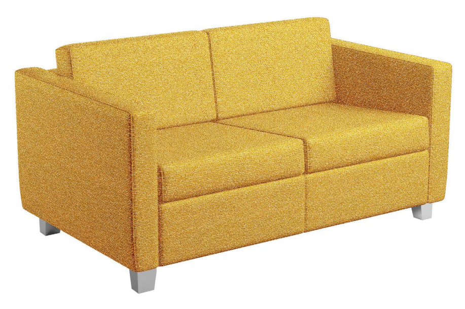
1222-CH FUSE | PATTERN COLLECTION FUSE13 | Saffron

The Danforth II Series can be upholstered using high-quality textiles, vinyls, and leathers. We have a variety of colors and grades to choose from.