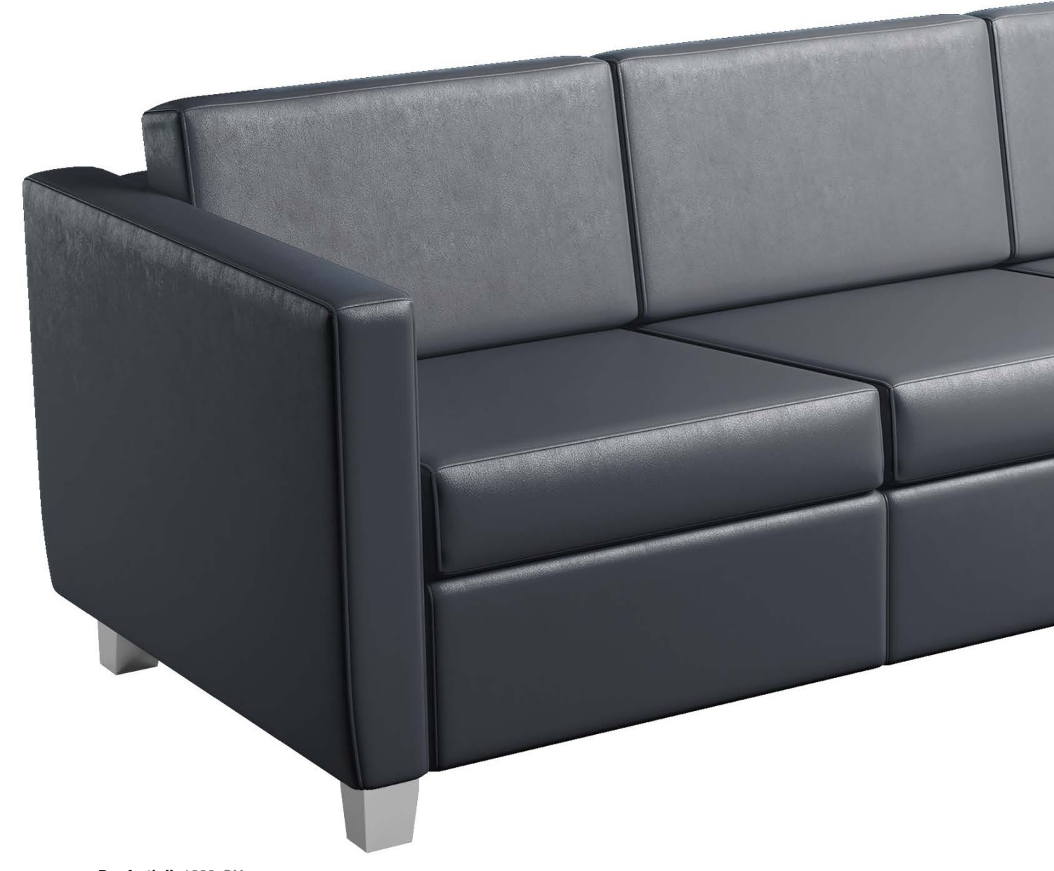
Danforth II 1223-CH Princess (Marine)