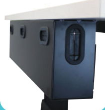
Wire Management Box XWMB