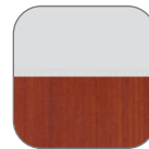
Silver Base (S) Cherry Top (CH)