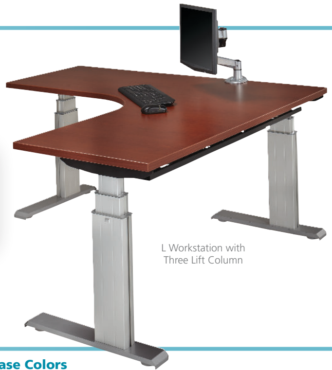
L Workstation with Three Lift Column

See Spec Book for complete specifications: raproducts.com/price