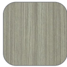
Concrete Groovz (CG)**◆