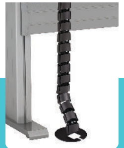
Flex Wire Management FCM490