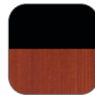
Black Base (B) Cherry Top (CH)