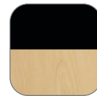
Black Base (B) Hardrock Maple Top (HM)