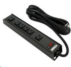
Power Receptacle PSSM-6-2