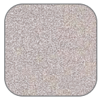
Gray Matrix (GM)◆***

(Only Available on Standard 24" and 30" Configurations)