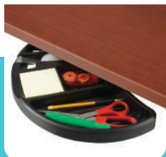
Swivel Pencil Tray 300PTB