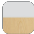
Silver Base (S) Hardrock Maple Top (HM)

◆Includes 4EVERedge™ edge banding for straight line worksurfaces **Driftwood, Concrete Groovz, and Merapi, Reclamation Maple have Graphite edge banding