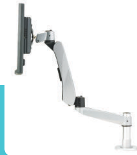
Hover Series 2 Monitor Arm HS3111