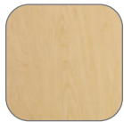
Hardrock Maple (HM)◆

Featuring eleven laminate colors with coordinating edge band options. High-pressure laminate and custom colors available.