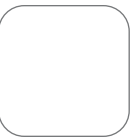
Galaxy White (GW)◆