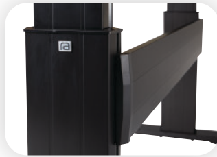
Optional cross support available